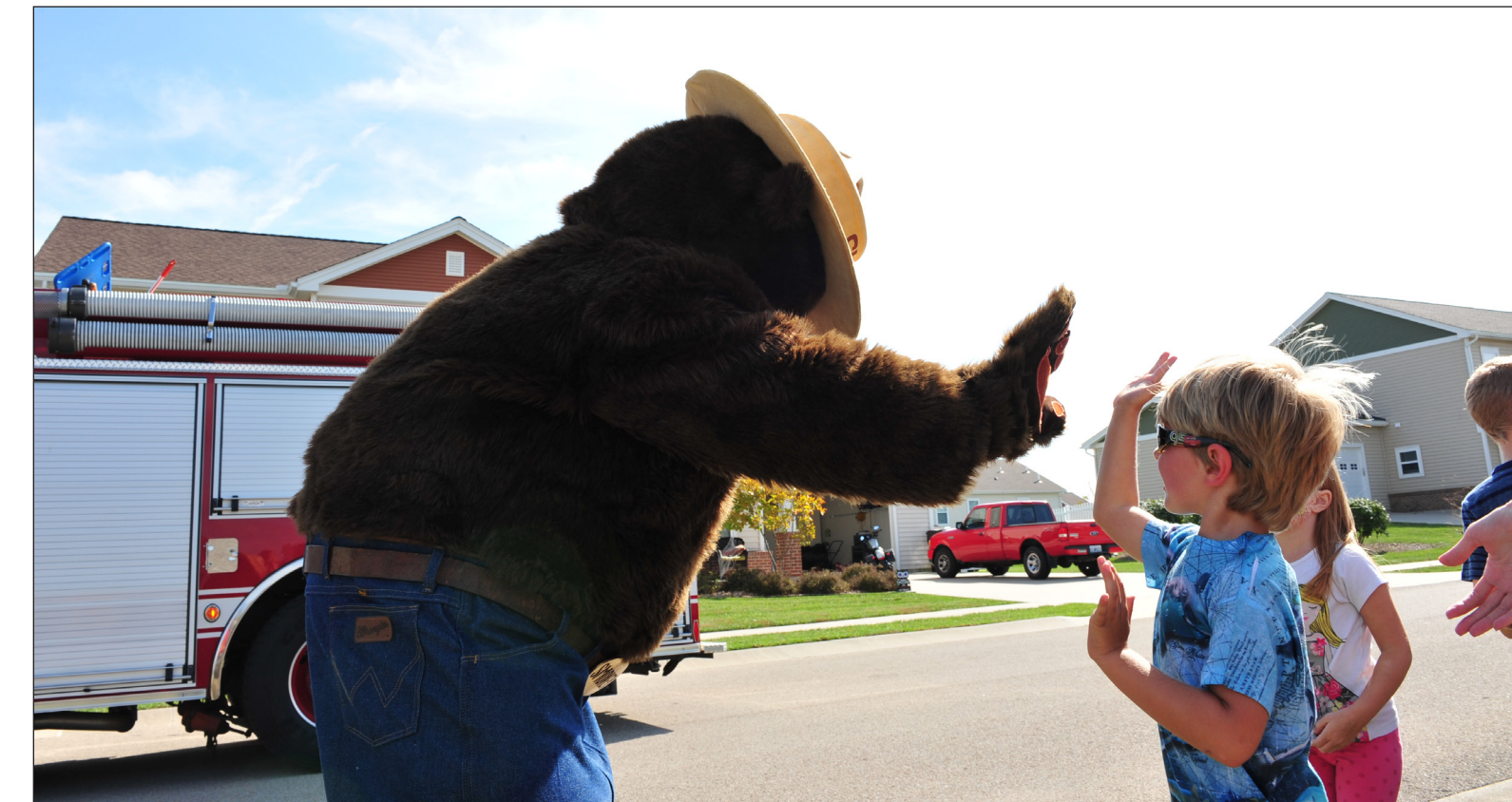
Smokey the Bear, a fire prevention mascot, awaits a high fives from a Team Whiteman youth at Whiteman Air Force Base, Mo., Oct. 15, 2016. Smokey along with two other fire prevention mascots participated in the parade.