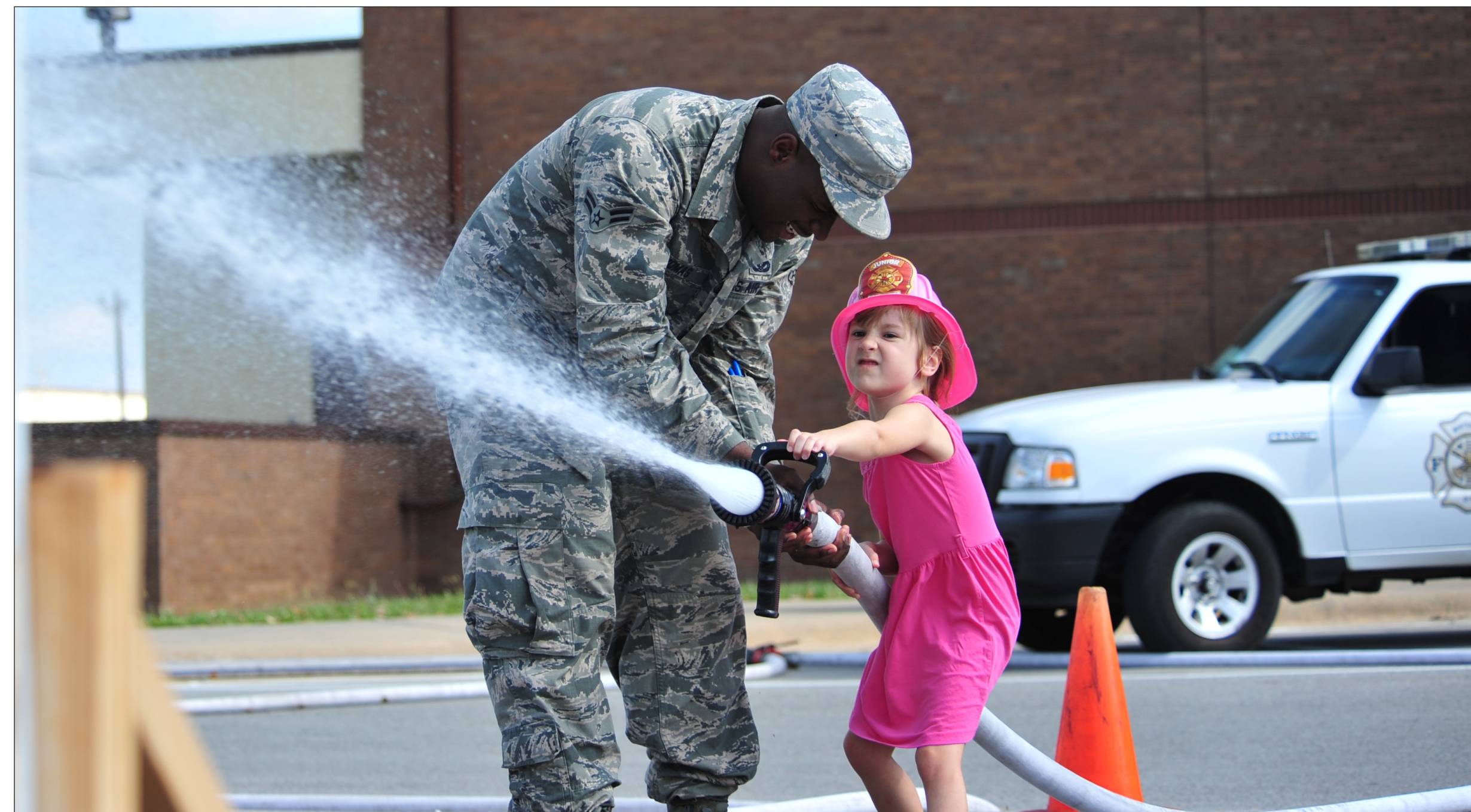
A firefighter assigned to the 509th Civil Engineer Squadron assists a Whiteman youth in using a fireman's hose to demonstrate firefighting techniques. The fire prevention week finale gave participants an opportunity to see firsthand techniques used by Whiteman firefighters.