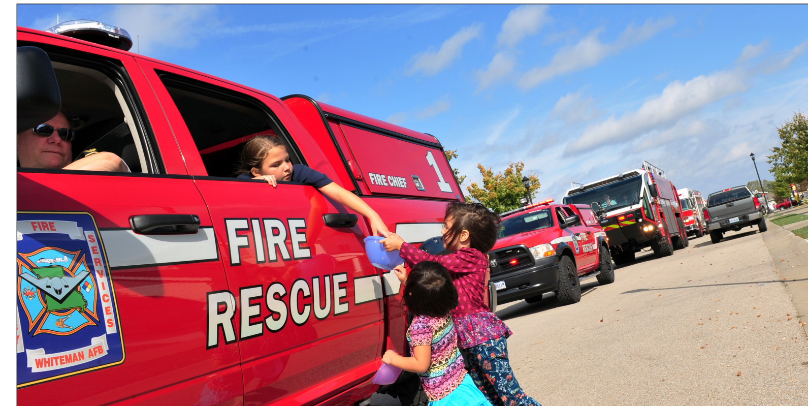
Members of Team Whiteman pass out candy to base housing residents during a Fire Prevention parade at Whiteman Air Force Base, Mo., Oct. 15, 2016. The fire prevention parade was the finale to Whiteman's annual fire prevention week.