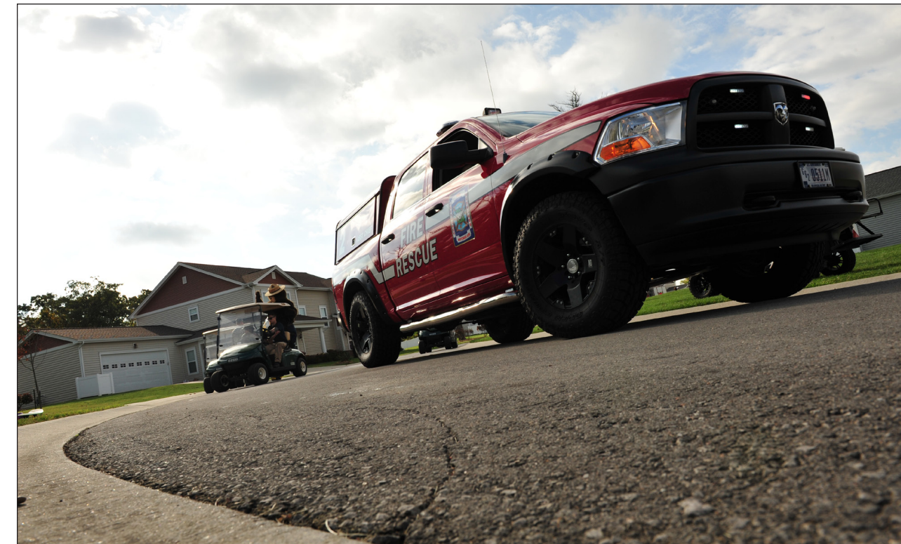
Members of the 509th Civil Engineer Squadron drive fire safety vehicles as part of a fire prevention parade at Whiteman Air Force Base, Mo., Oct. 15, 2016. The parade passed through base housing and concluded at the base commissary.