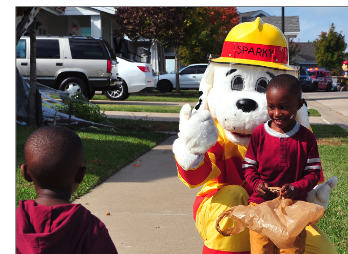
Spark the Dog, a fire prevention mascot, hugs a Whiteman youth and awaits another to join for a group photo at Whiteman Air Force Base, Mo., Oct. 15, 2016. Members of Team Whiteman along with the fire prevention mascots met with families and passed candy to youth as part of the parade finale.