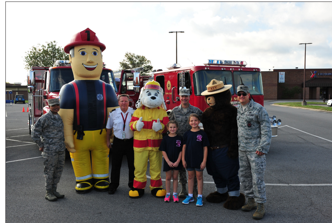
Members of Team Whiteman gather for a group photo prior to the start of the fire prevention finale parade at Whiteman Air Force Base, Mo., Oct. 15, 2016. Fire prevention week is an annual event recognizing fire safety hazards and ways to prevent them from happening.